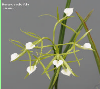
B. subuliflora Image and grown by Allen Black