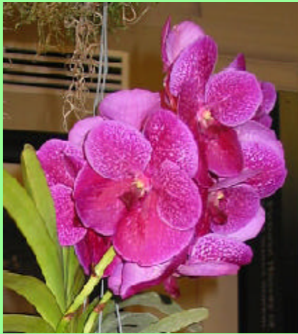
Ascda. Queen Florist