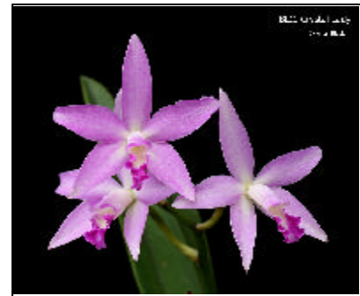
Blc. Crystal Lady Image and grown by Allen Black

Paph. Delophyllum is a primary cross between P. delenatii and P. glaucophyllum . The cross was registered in 1940, and can be seen from the picture, can make a dramatic presentation. The flower shows a blending of both parents, though the Parvisepalum influence of