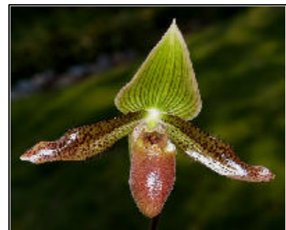
Paph. wardii Grown by the Creeches

Paph. wardii is a species found in SW China and Northern Burma in deep leaf litter on cliff faces. The plant requires an early winter rest of about a month, then the flower typically emerges in the mid-winter to early spring. This species was first described by Ward in 1920.