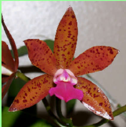
C. Bernie Blanck Grown by L.K. (Buddy) Harvie

Vasco. Viboon Velvet 'Perfection' HCC/AOS earned its award last October at the National Capital Orchid Show. This hybrid was registered in 1992 by its originator, T. Orchids of Thailand. The parents of this hybrid are Ascda. Tubtim Velvet and Rhy. coelestis. Although much of the coloration of the Rhy. coelestis parent is carried over into this plant, Ascda. Tubtim Velvet clearly improves the fullness of the resulting flower.