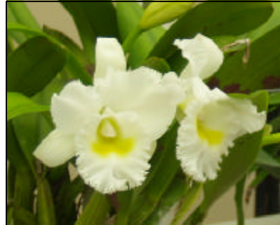
Bc. Pastoral Innocence AM/AOS