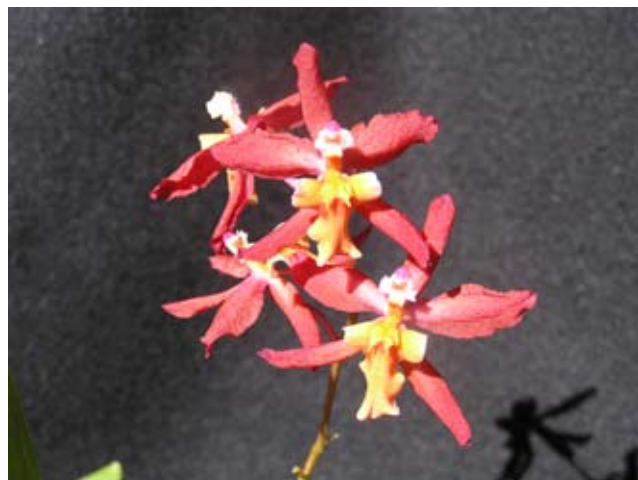
Onceda. Charlesworthii 'Mishima'

My interest in classic [old] hybrids and clones of cattleyas continues, and these are added at the expense of new hybrids. Most orchid hobbyist gravitate towards some