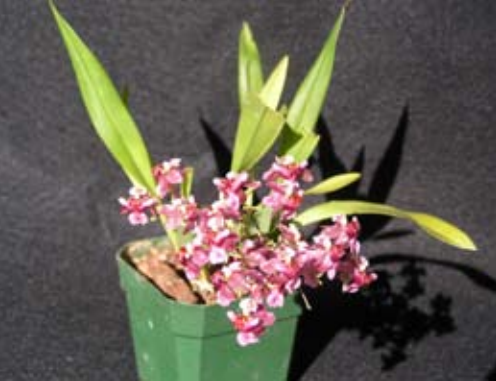
Onc. Red Twinkle